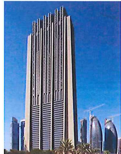
The Index, Dubai. 2011 Best Tall Building Middle East & Africa.

The Council issues four regional Best Tall Building Awards annually to give recognition to projects that have made extraordinary contributions to the advancement of tall buildings and the urban environment, and that achieve sustainability at the highest and broadest level. The KfW Westarkade project was also recognized as the Best Tall Building in the Europe region. Also recognized at the ceremony were: Eight Spruce Street, New York which took the Best Tall Building Americas award, Guangzhou International Finance Center, Guangzhou took the Best Tall Building Asia & Australasia award, and The Index, Dubai took the Best Tall Building Middle East & Africa award.