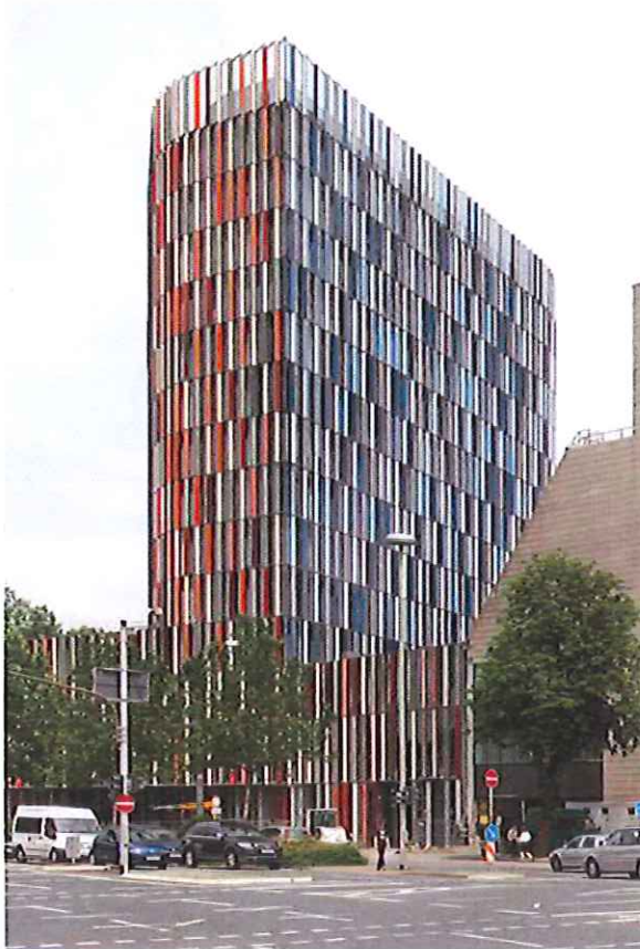
KfW Westarkade, Frankfurt. 2011 CTBUH Overall "Best Tall Building Worldwide"