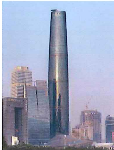
Guangzhou International Finance Center, Guangzhou. 2011 Best Tall Building Asia & Australasia