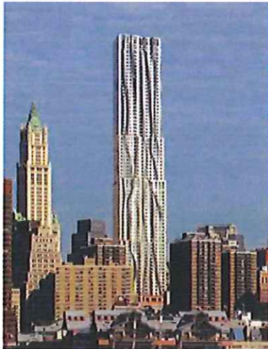
Eight Spruce Street, New York. 2011 Best Tall Building Americas